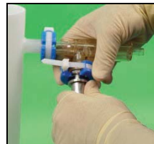
Insert cable tie end and slide clamp closed