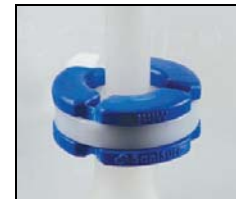
SaniSure clamp installed

As the industry's attention focuses on reducing cleaning validation costs and improving tear down/installation times, the SaniSure CLAMP answers each of these challenges, improving overall production efficiency.