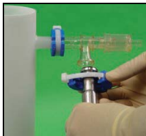
Position SaniSure Clamp around tri-clamp fitting

The SaniSure CLAMP is quick and easy to secure, installing in less than 5 seconds with controlled torque and single-handed tensioning. The SaniSure CLAMP is light weight, low profile, and completely tamper proof.